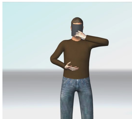
Fig. 1: A neck scratch self-adaptor occurring simultaneously with a gesture using motion planning for an emotionally stable personality type.

Body language. After hand gestures and self-adaptors, the two aspects of body language most commonly described to vary with EMS were posture and head movement. Feyerreisen and de Lannoy observe more changes in posture for individuals with low EMS ratings, but do not explain how or when such changes occur [13]. Waxer’s results suggest that individuals with low anxiety move the upper body more freely than individuals with high anxiety, though the differences were not significant. Wallbott notes the presence of a more “collapsed” posture for low EMS individuals [42]. Campbell and Rushton observed greater forward lean in individuals who tested high for anxiety, which could possibly be a property of the posture collapse observed by Wallbott [6]. With respect to these observations, we controlled the variance in posture for low EMS by increasing