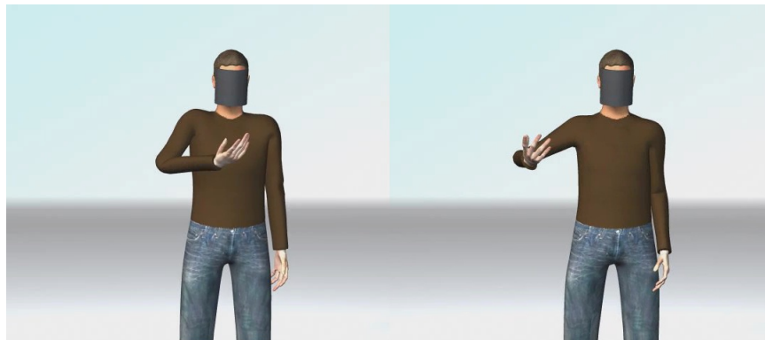
Fig. 2: A comparison between low EMS (left) and high EMS (right) motion for the same utterance.

Gesture Performance involved variations in both gesture and collarbone use. Reflecting a tendency to make fewer outward or other directed gestures, the path of low EMS gestures were adjusted to move inward, across the body whereas they moved outward in the high EMS case. The gestures were also made smaller. Abrupt downward beats were added to the low EMS gestures, reflecting reported increased irregularity. Posture adjustments for low EMS included bringing the collarbones up and in, bringing the elbows in and making more rapid posture shifts. These reflected a less relaxed posture and more rapid posture changes. Figure 2 illustrates differences in gesture placement and posture.