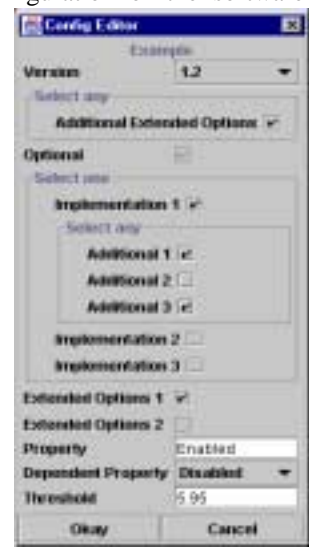
Figure 2: Configuration Editor

The update agent deploys a new, previously unavailable configuration of a deployed