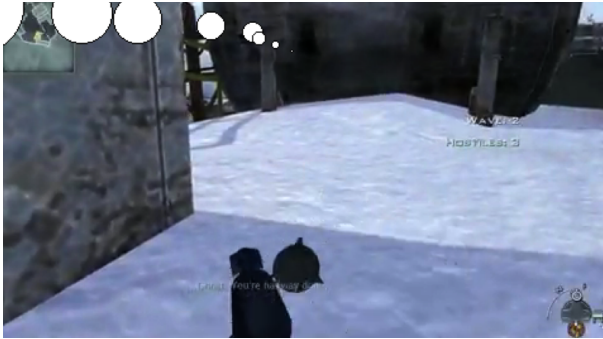
Figure 2: High-fidelity prototype with white visualizations indicating enemy gunfire to the left of the player.

High-fidelity prototyping. The high-fidelity prototype was created in Processing and was used as an overlay with a video of gameplay. A screen capture of the high-fidelity prototype is shown in Figure 2. The high-fidelity prototype showed that DSD was capable of visualizing sound in three ways: pitch , intensity , and direction . In the screen capture shown in Figure 2, eight white circles represent the logarithmic pitch averages of the sound input. The size of the circles indicates the intensity or loudness of each of the data points. Finally, the circles are drawn to the left or to the right of the screen center, depending on which side of the sound mix is louder, to indicate the direction of the sound.