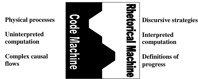
Figure 2. Total system = code machine + rhetorical machine

These rhetorical strategies enable researchers to use language such as “goal”, “plan”, “decision”, “knowledge”, to simultaneously refer to specific computational entities (pieces of program text, data items, algorithms) and make use of the systems of meaning these words have when applied to human beings. This double use of language embeds technological systems in broader systems of meaning.