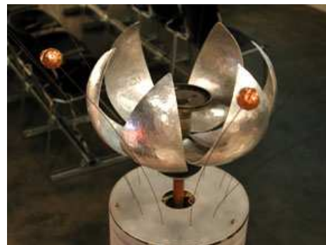
Figure 1. Office Plant #1.

Walk into a typical, high tech office environment, and, among the snaking network wires, glowing monitors, and clicking keyboards, you are likely to see a plant. In this cyborg environment, the silent presence of the plant fills an emotional niche. Unfortunately, this plant is often dying; it is not adapted to the fluorescent lighting, lack of water, and climate controlled air of the office. Office Plant #1 [5] is an exploration of a technological object, adapted to the office ecology, that fills the same social and emotional niche as a plant. Office Plant #1 employs text classification techniques to monitor its owner's email activity. Its robotic body, reminiscent of a plant in form, responds in slow, rhythmic movements to express a mood generated by the monitored activity. In addition, low, quiet, ambient sound is generated; the combination of slow movement and ambient sound thus produces a sense of presence, responsive to the changing activity of the office environment.